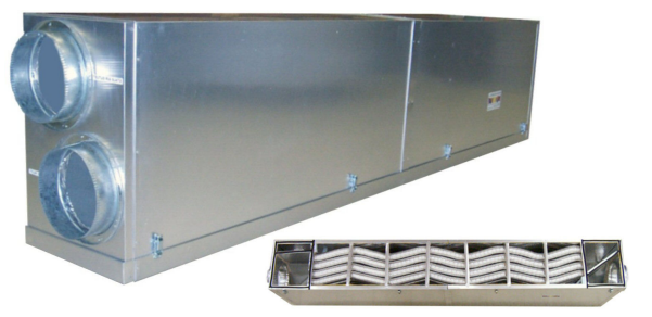
Interior view (bottom)

The commercial 'HAE-1000-500' is 14"x 23"x 100" Shipping Weight = 80lbs.